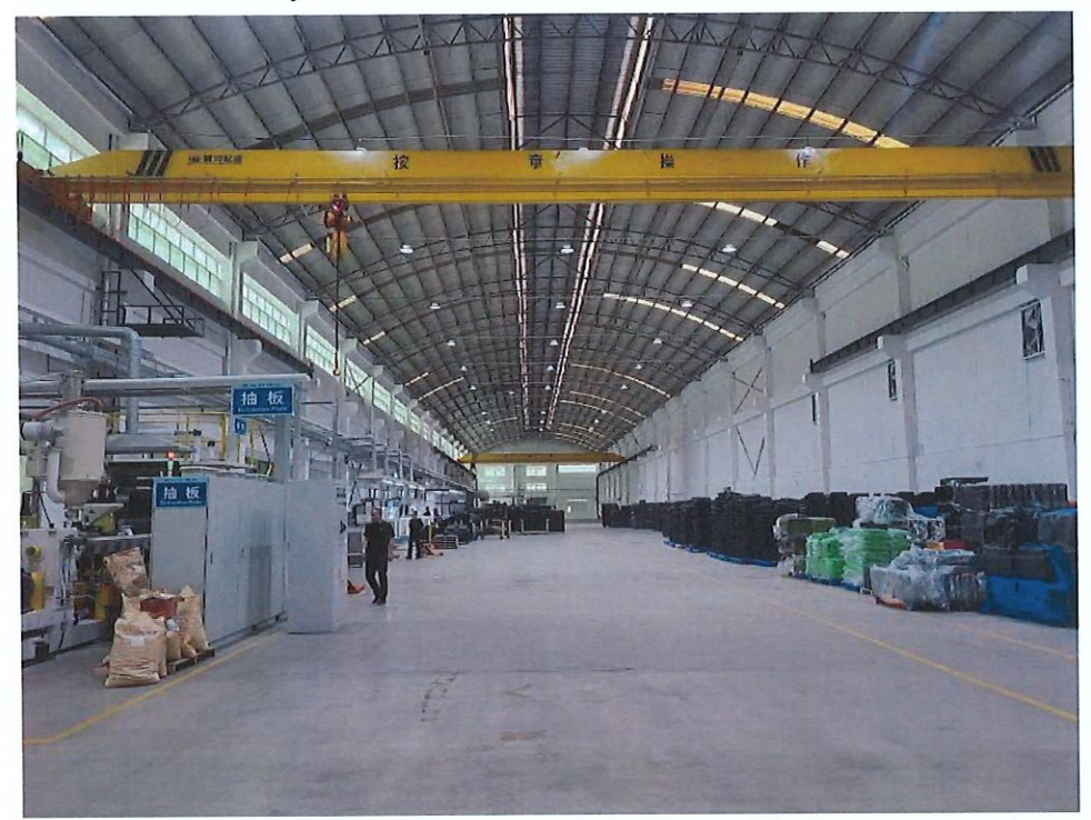
Injection Molding Machines