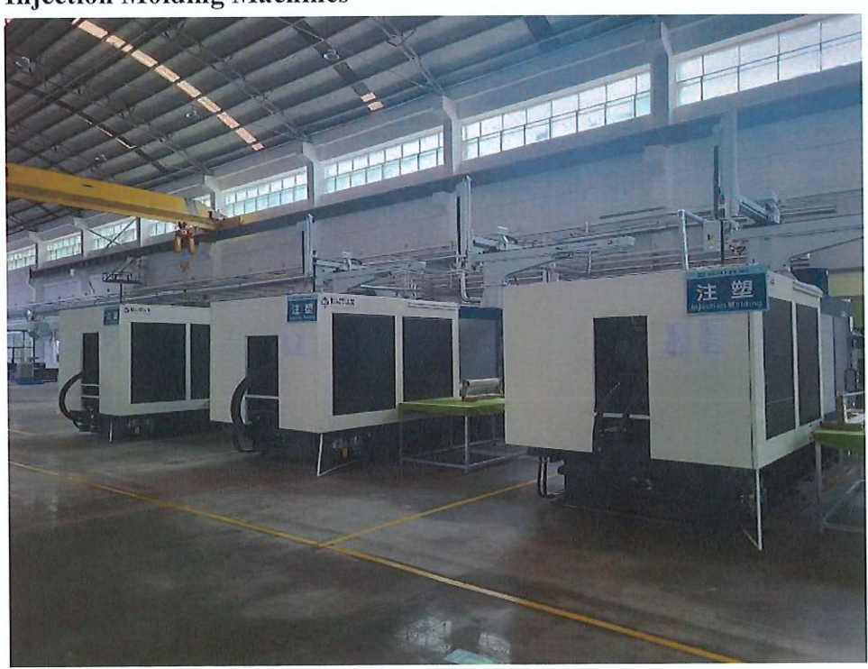
Page 17 of 19